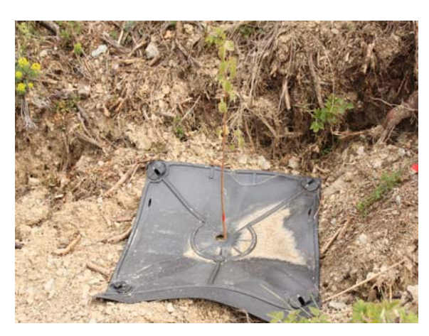
100% biodegradable semi-rigid mulch (DTC)