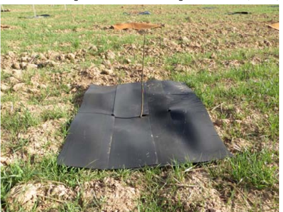
Reusable recycled rubber mulch (EcoRub)

Sustaffor Project is financed by 7th Framework Programme of the European Union through the "Capacities - Research for SMEs" call. Duration: from October 2013-September 2015.