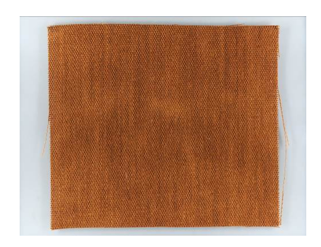
40x40 / 80x80 cm model

\rightarrow A 100% biodegradable mulch made with woven jute cloth treated with furan bio-based resin for increased durability, developed by the Belgian SME La Zeloise NV. This company works with natural fibre products, especially recycled jute, treated with innovative finishing techniques for enhanced properties.