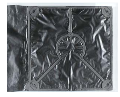
40x40 cm model, for conditions; right: 80x80 cm model for high quality sites

→ A 100% biodegradable frame based on a new biopolymer formulation, developed by the Belgian SME DTC, fused to a commercially available biodegradable film. This company is expert in the fabrication of specialized plastic and bio-plastic products by mould injection.