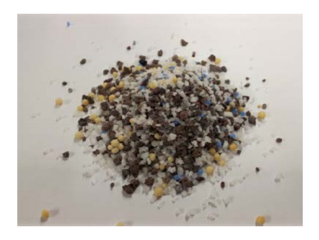
Aspect of the soil conditioner before being mixed with the soil

During the project, a mix of a new highperformance hydro-absorbent polymer combined with fertilizer and growth precursors will be developed by the Spanish TerraCottem Internacional company is developer and distributor of the TerraCottem® soil conditioning technology, a proprietary mixture of polymers, fertilizers, growth precursors and carrier material that is unique for its synergetic effect; this technique stimulates plant growth, increases the capability of soils and growing media to retain and provide water and nutrients to the plants and reduces the amount of water necessary to create high-quality plants and turf.