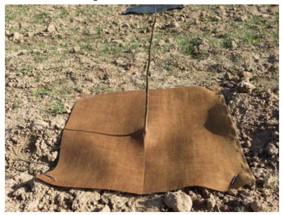
100% biodegradable jute mulch (La Zeloise)