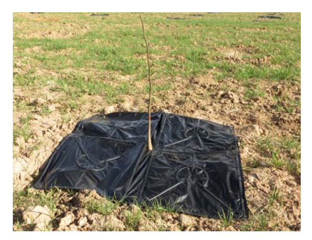
100% biodegradable framed mulch (DTC)