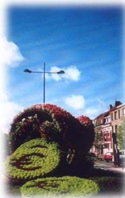
The Horn of Plenty