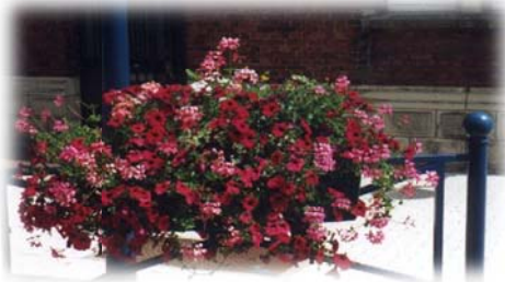
Basket in July 2000

No TerraCottem® Universal, 1.5 kg/m 3 mineral soluble and 1.5kg/m 3 slow-release fertiliser