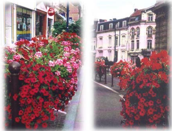
Basket in July 2001

No TerraCottem® Universal, 1.5 kg/m 3 mineral soluble and 1.5kg/m 3 slow-release fertiliser