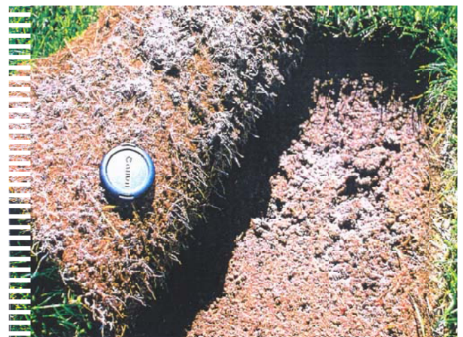
Fig. 6 & 7 The rooting of sod into the top layer with (bottom) and without (top) TerraCottem (9.7.1997)