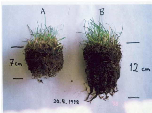
Fig. 5 Root system of the turf on a TerraCottem®-treated area (right) and a non- treated area (left) (20.05.98)