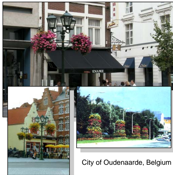
City of Oudenaarde, Belgium

TerraCottem® Universal More Growth, Less Water www.terracottem.com