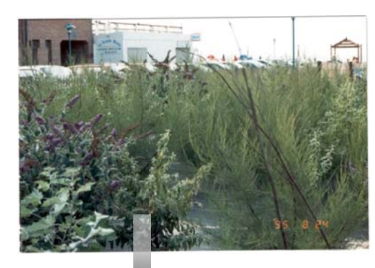
Photo 3 : 100 days later Buddleia on the left and Tamarix on the right) In the previous planting schemes the plants were much smaller.